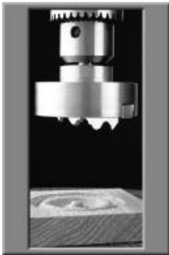
Rosette Cutterhead Only #W1250

For years, rosette cutters have been priced out of the reach of the average woodworker. That was until now! Finally, a manufacturer has taken the time to develop an affordable rosette cutter system to fill your needs. The HSS knives will produce the intricately-carved, rosettes up to 3" in diameter. Purchase the cutterhead and then select the interchangeable pattern you wish to carve. The 1/2" shank on the cutterhead is easily installed in your drill press and should be operated between 250-350 RPM for the best results.